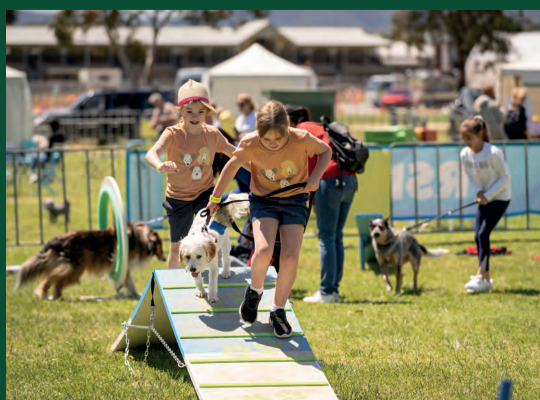
Fenced Short-Term Events