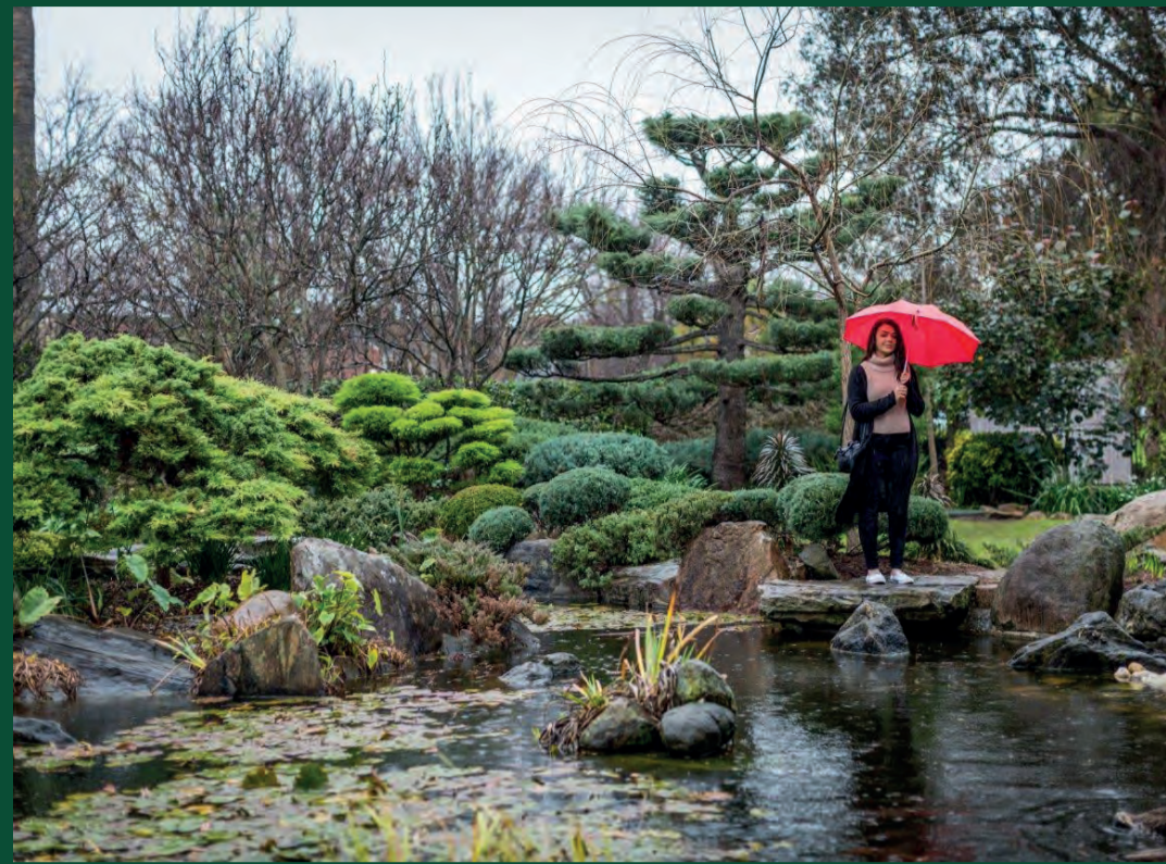
Open Ornamental Park Lands