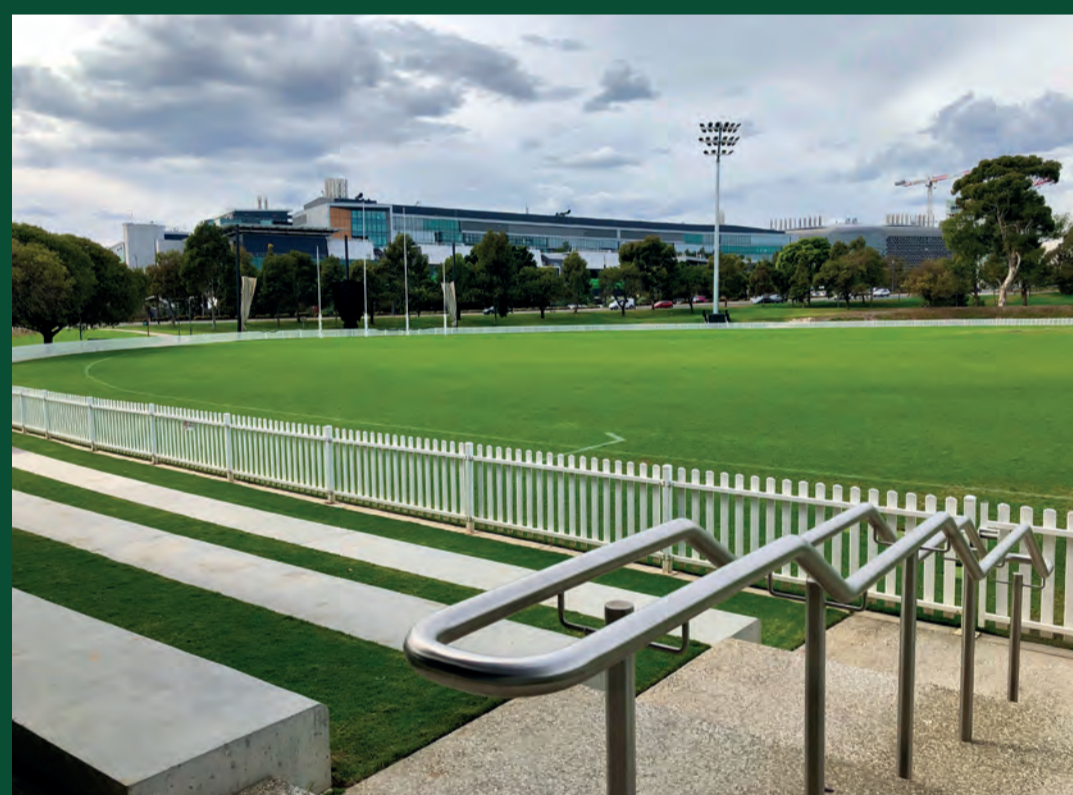
Fenced Sporting Ovals