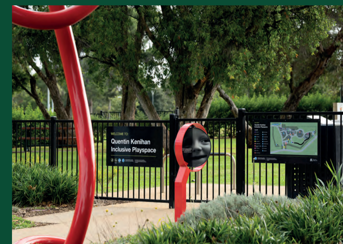
Fenced Recreation Spaces