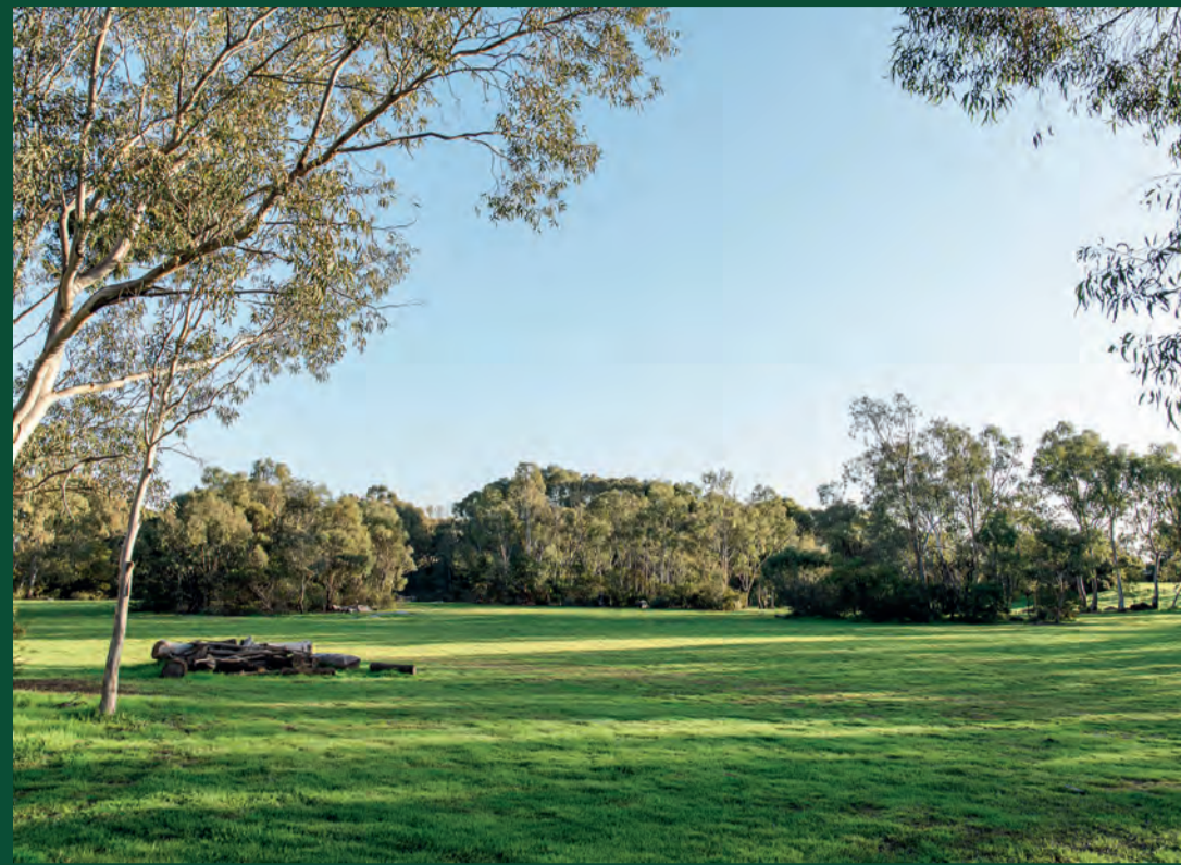
Open Park Lands