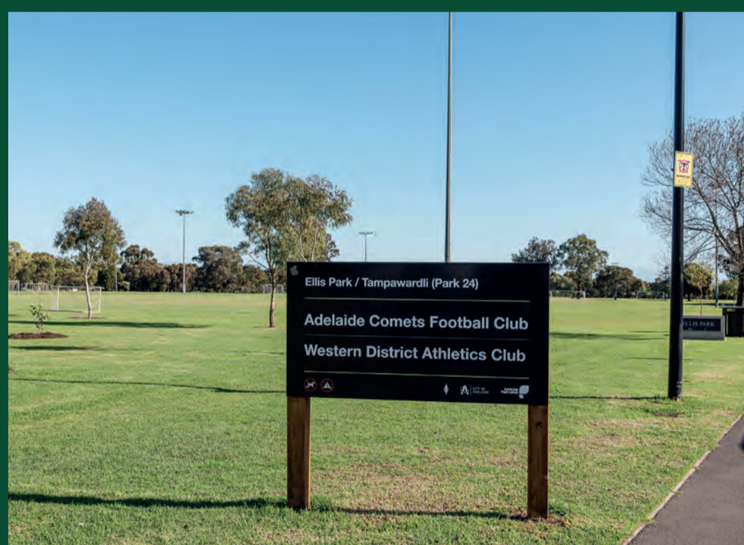
Open Licensed Park Lands