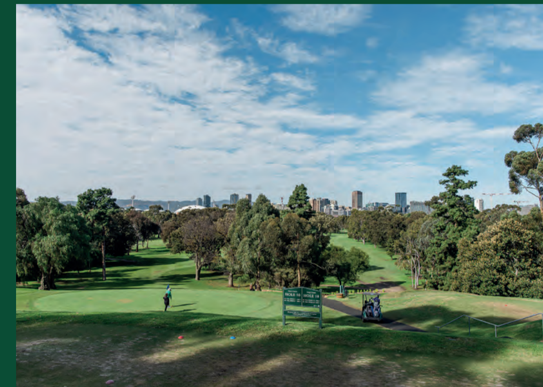
Open Recreation (Programmed) Park Lands