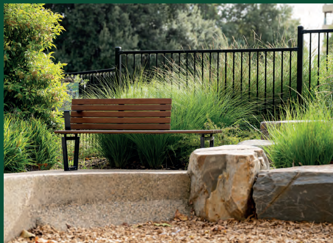
Open Park Lands with Safety Fencing