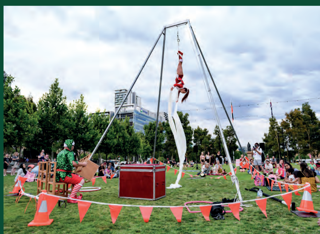
Open Short-Term Events