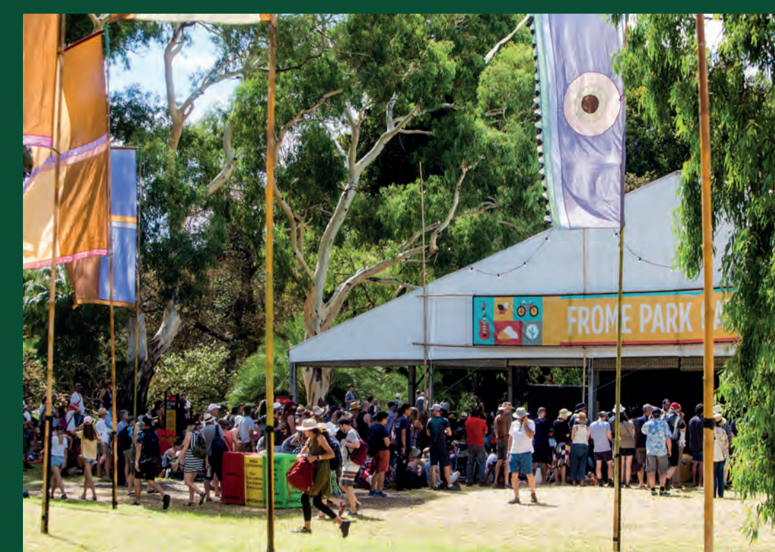
Fenced and Ticked Short-Term Events

Do you feel alienated from any of the above spaces in the Park Lands?