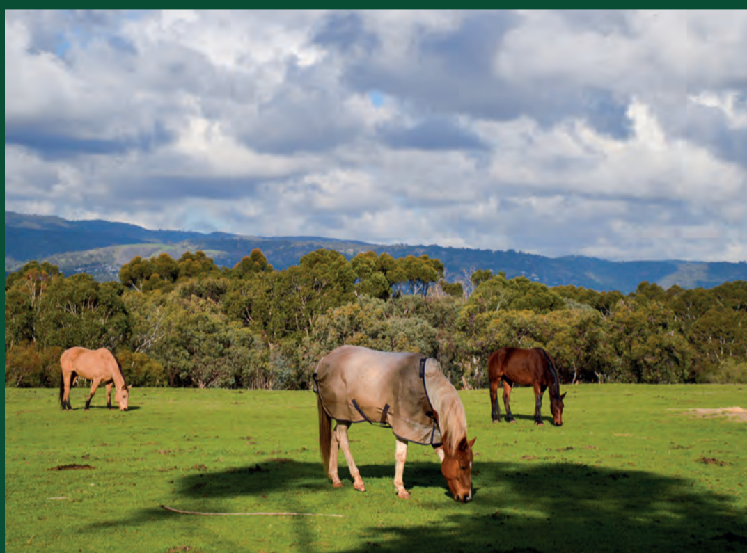
Fenced Licensed Park Lands